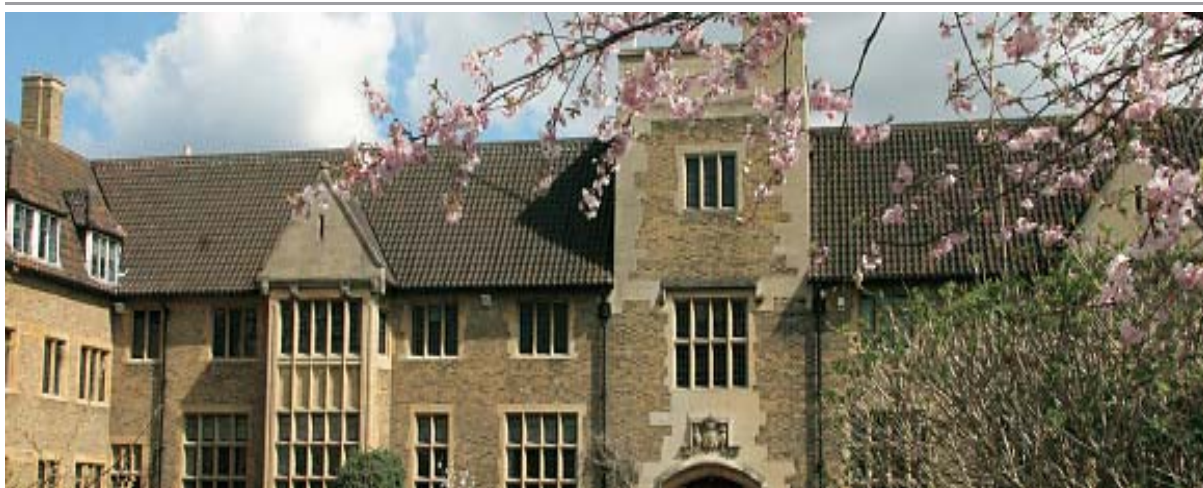
The magnificent Cheshunt College in Bateman Street, Cambridge, now the Province of Cambridgeshire Masonic Headquarters